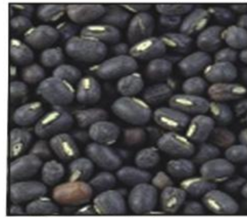
Black Gram ( उडीद )