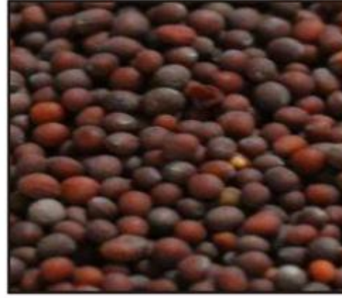
Mustard ( रायड )