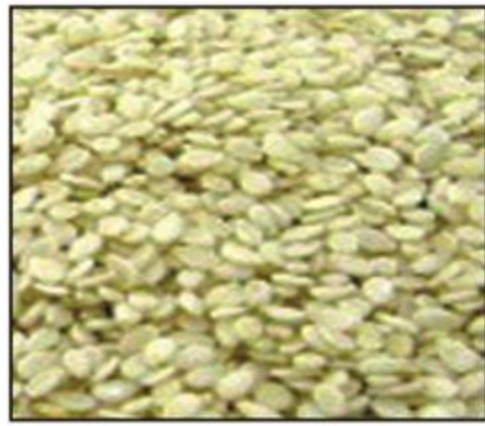
Sesame ( तिल )