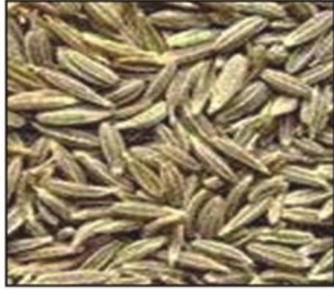
Cumin ( जीरा )