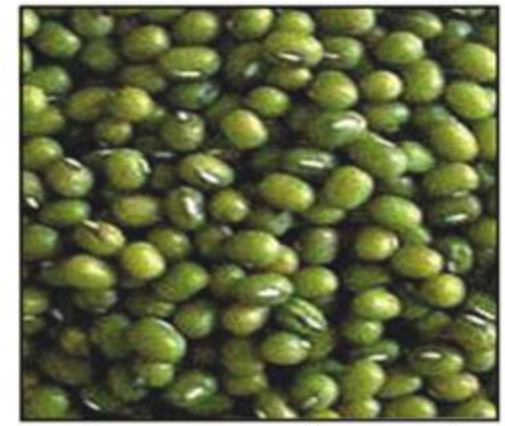
Green Gram ( मुंग )