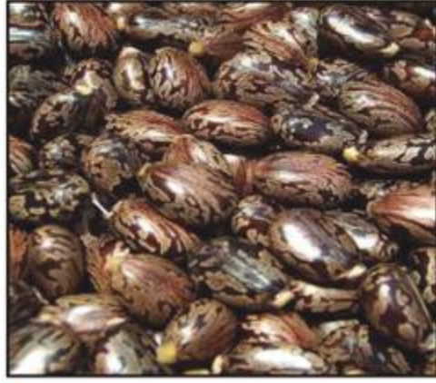
Castor ( एरंडी )